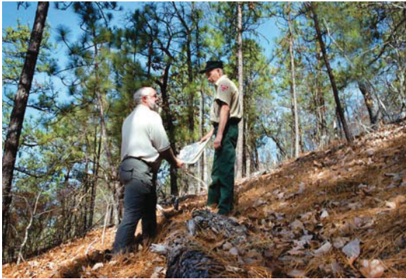
GFC Ranger and landowner plan firebreak location.

Aerial photographs, soil maps and topographic maps combined with an on-site evaluation will help identify the streams, gullies and highly erodible sites on the property. Proper planning will ensure that firebreaks are effective and environmentally sound.