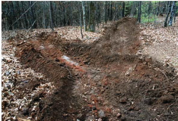
An appropriate water diversion moves water away from the main firebreak and into a stable vegetated area.