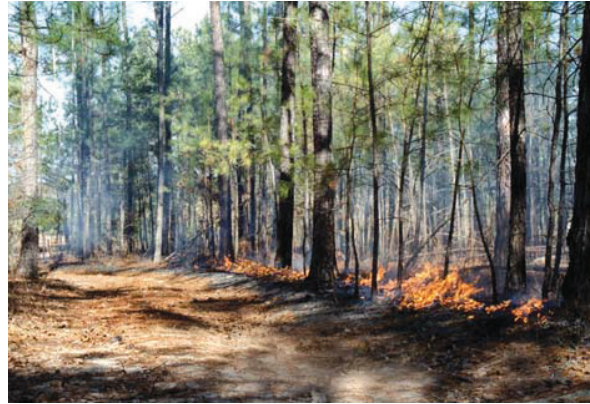
A woods road serves as a natural firebreak.