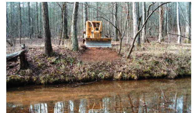
Ranger back blades with dozer to minimize soil disturbance in an SMZ.

**Use grades of 40% and steeper only for short stretches