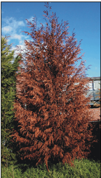
Figure 6. Tree killed by Phytophthora root rot.

There is no effective control once the tree is infected. As a preventive measure, remove the stumps of felled conifers completely or treat the stump surface with borax immediately after the tree is felled.