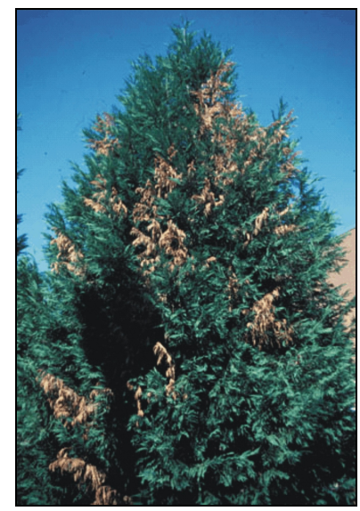
Figure 3. Branch dieback symptoms of Seiridium canker.

Sanitation, such as removal of cankered twigs