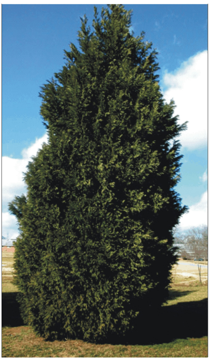
Figure I. Healthy, mature Leyland cypress.

In Georgia, Seiridium canker is probably the most important and destructive disease on Leyland cypress in the landscape. Although the fungi Seiridium cardinale, Seiridium unicorne, and Seiridium cupressi have been reported to cause disease on Leyland cypress and other needled evergreens, only Seiridium unicorne is most commonly associated with cankers and twig dieback on Ley-