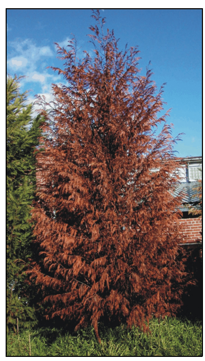
Figure 6. Tree killed by Phytophthora root rot.

Decayed, darkened roots are a symptom of the disease; however, Phytophthora root rot can only be diagnosed with certainty by laboratory analysis