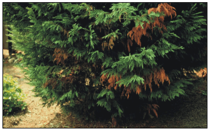
Figure 5. Dark, rust-colored dieback symptoms of Botryosphaeria (Bot) canker. the canker as it grows.

In the landscape, Bot canker symptoms resemble those caused by Seiridium canker. Bright, rust-colored branches and yellowing or browning of shoots or branches are the first observed symptoms. Closer inspection reveals the presence of sunken, girdling cankers at the base of the dead shoot or branch. Sometimes, the main trunk shows cankers that might extend for a foot or more in length. These cankers rarely girdle the trunk, but they will kill branches that may be encompassed by