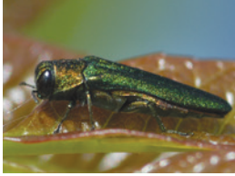
EAB adults must feed on foliage before they become reproductively mature.

may also result in puddles of insecticide that could wash away, potentially entering surface water or storm sewers. To further protect surface and ground water, soil applications should not be made to excessively sandy soils with low levels of organic matter that are prone to leaching, especially where the water table is shallow, or where there is risk of contaminating gutters, ditches, lakes, ponds, or other bodies of water.