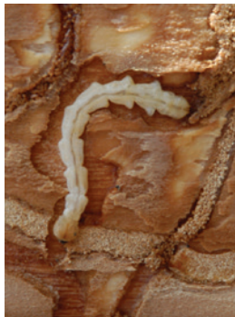
EAB larvae damage the vascular system of the tree as they feed, which interferes with movement of systemic insecticides in the tree.

Two of the most recent studies have shown that even when TREE-äge™ is applied at the lowest rate on the label (0.1 g ai or 2.5 ml per DBH inch), trees are protected from EAB for three years. A six year MSU study quantified EAB larval densities on trees treated annually, at 2 year intervals or at 3 year intervals with a low (2.5 ml per DBH inch) or medium (5 ml per DBH inch) rate of TREE-age, dinotefuran