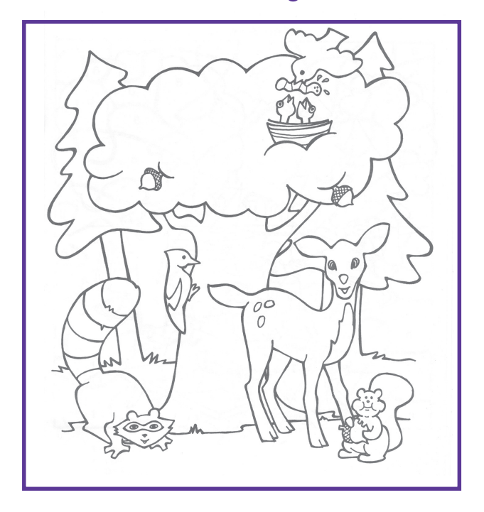
Find 6 things different about these two forest scenes:

ANSWERS: Bear, Owl, Rabbit, Snake, Oposeum, Squirrel, Turtle, Mouse, Skunk, Lizard, Spider, Butterfly.