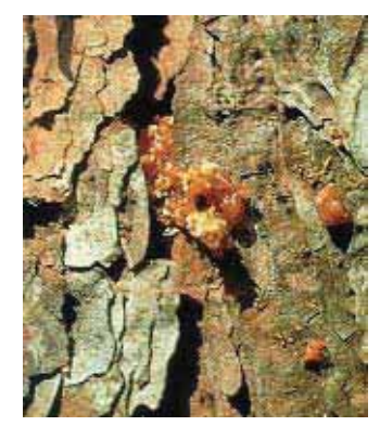
Ips pitch tube

Southern pine beetle galleries are curved or S-shaped and are normally packed with a brown frass and boring dust produced by the beetles. Black turpentine beetle galleries are D- or fan-shaped galleries. Ips egg galleries are roughly Y- or H-shaped and radiate out from a central camber.