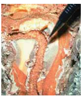
BTB galleries.