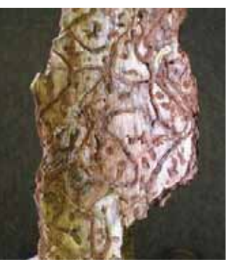
SPB galleries.