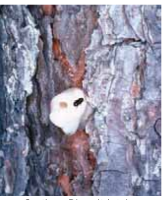
Southern Pine pitch tube.