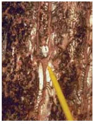
Ips galleries.