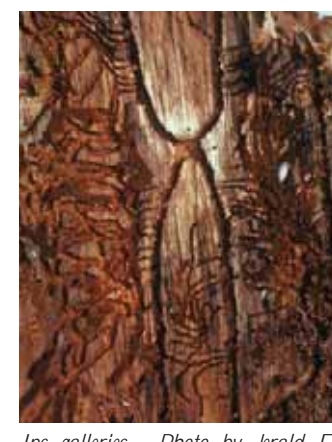
Ips galleries.