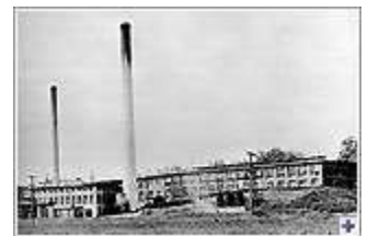
Crown Cotton Mill

The Great Depression and the General Textile Strike of 1934 dealt severe blows to the Crown Cotton Mill, which managed to stay in operation until 1969. Modern Dalton still testifies to the strong legacy of the carpet and textile industries. As a leading industrial center in the country, the city confidently proclaims itself the "Carpet Capital of the World."