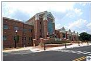
Whitfield County Courthouse

The United States signed a treaty with the Cherokees in 1798, guaranteeing their rights to the land in north Georgia that included Whitfield County. In violation of that treaty, however, the state of Georgia claimed authority over the area in 1828. In 1838 the U.S. government, pressured by the state, removed the Cherokee Indians from their lands in Georgia to a reservation in Oklahoma. The forced march from Georgia became known as the Trail of Tears, owing to the number who died along the route.