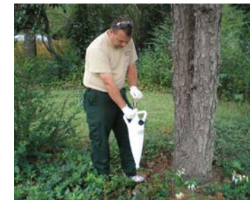
Figure 4 - Insecticide being applied by using a soil injector to inject the chemical into the ground.

Soil Treatments: In this systemic treatment, an approved insecticide is applied to the soil around the base of the tree and is taken up by the root system. There are several products that are labeled for this type of application. This includes products that contain the active ingredient, imidacloprid, such as Bayer Advanced Tree & Shrub Insect Control®, Merit®, Imidipro®, Touchstone®, Zenith®, Quali-Pro®, and Lesco®. A product called Safari 20 SG®, containing the active ingredient