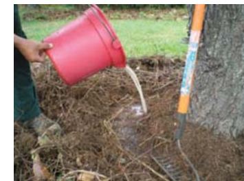
Figure 5 - Insecticide being applied to the soil by mixing the chemical with water and pouring around the tree.

is also effective. Bayer Advanced Tree & Shrub Insect Control® can be purchased at most hardware stores and the other products can be purchased from pesticide distributors or some farm supply stores. The application is made by mixing the chemical with water and injecting or pouring it into the soil around the base of the tree (Figures 4 & 5). Soil applications are best made in the spring (March to early June) or fall (mid-September to mid-November) when adequate soil moisture is present. Avoid applications to frozen or waterlogged soil. One application can provide protection for two to three years. Soil injection is currently the most effective approach for treating HWA.