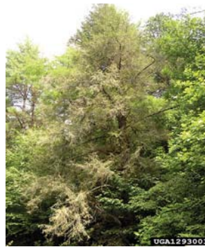
Figure 3 - Hemlock tree in serious decline due to HWA infestation.

All ages and sizes of hemlocks can be attacked by the HWA. The pest causes damage to the tree by feeding on the starch it produces. This inhibits the tree's ability to produce new growth. Trees that have been infested for a couple of years will show visible signs of decline. Unhealthy hemlocks will appear a dull green to gray color, possess premature needle loss, and exhibit branch die-back (Figure 3). Tree mortality usually occurs after four to ten years of infestation.