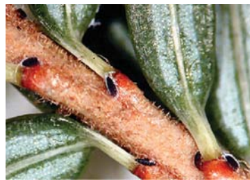
Figure 2 - HWA nymphs in summer dormancy.

settles at the base of a needle, then inserts a long feeding tube called a stylet. The developing adelgid will remain here until reaching maturity in May to early June. If tree health is very poor, a portion of the spring generation will form into winged adults that fly off in search of a spruce tree. However, no suitable species of spruce is found in North America, resulting in the death of the winged adelgids. The spring generation adults that remain on the tree lay 20-75 eggs each, beginning the winter generation. Crawlers hatch from the eggs in late June to early July and disperse to settle