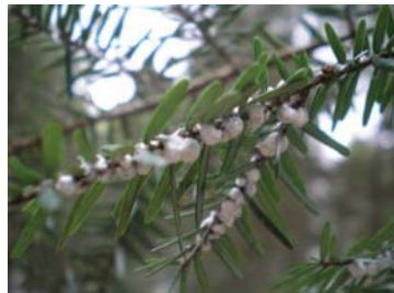
Figure 1 - Mature HWA and ovisacs in late winter.

The hemlock woolly adelgid is a tiny insect measuring approximately 1/16 of an inch long. As the adelgid matures, it produces and covers itself and its eggs with a white, waxy filament (Figure 1). This waxy covering provides protection from predators and from drying out. The adelgid is most conspicuous from late fall to early summer when the "woolly" covering is present. Adelgids are found primarily on the underside of branches at the base of needles on the newest growth.